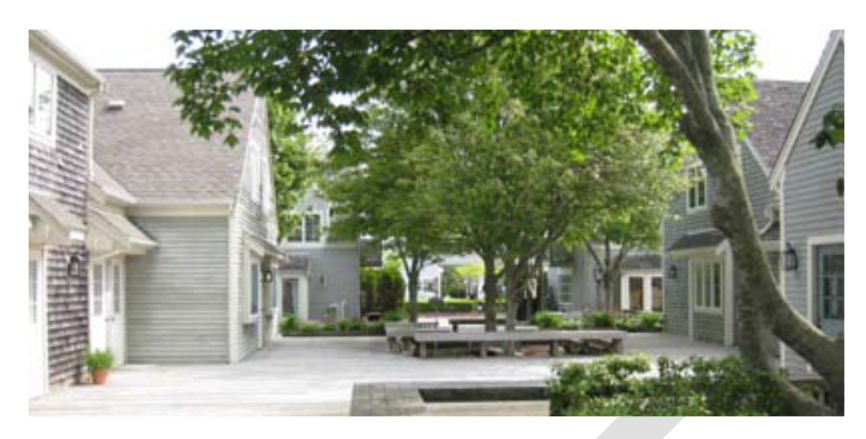
Example of courtyard space in Falmouth, MA.