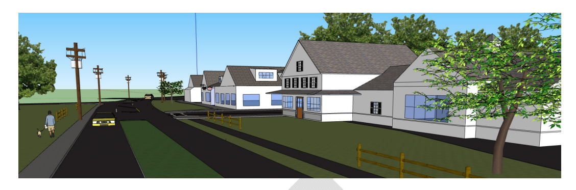
Example of potential building articulation and roofline repetition along Route 117.