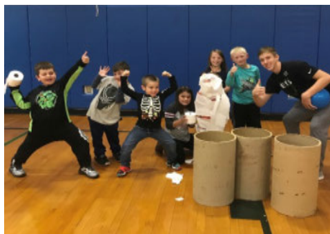
Celebrating Halloween invites children to be silly and creative

Building community, a sense of citizenship, and cultural awareness are also important elements of our program. At the Hale Extended Learning Program, students are engaged in a volunteer service program knitting hats for infants, making blankets for rescue dogs, and creating crafts for seniors. The Bolton site works closely with the Nashoba Valley Rotary Club to offer a fun and popular bike safety program. Our four sites offer various clubs like Homework Club, Coin Club, and Sewing Club, to connect students who have similar interests. Last year, all students experienced Saori weaving, a contemporary freestyle weaving from Japan, as well as made crafts/artwork connected to holidays and the world.