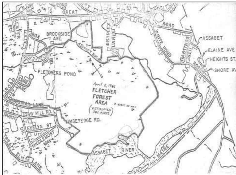
First known map of Fletcher Woods Acquisition Area of Interest

During this time Stow had just completed a Natural Resource Inventory and was embarking on its first Master Plan. The Inventory, the first of its kind in Massachusetts, was hailed by conservationists across the region, winning a statewide award. It also provided inspiration for a Town initiative with great foresight, to protect “one of the most promising multiple use open space areas in Stow,” a large tract of land along Elizabeth Brook and the Assabet River that was owned by the Estate of C.D. Fletcher.