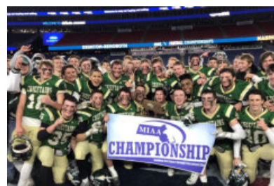
Football - MIAA Division 4 State Champions