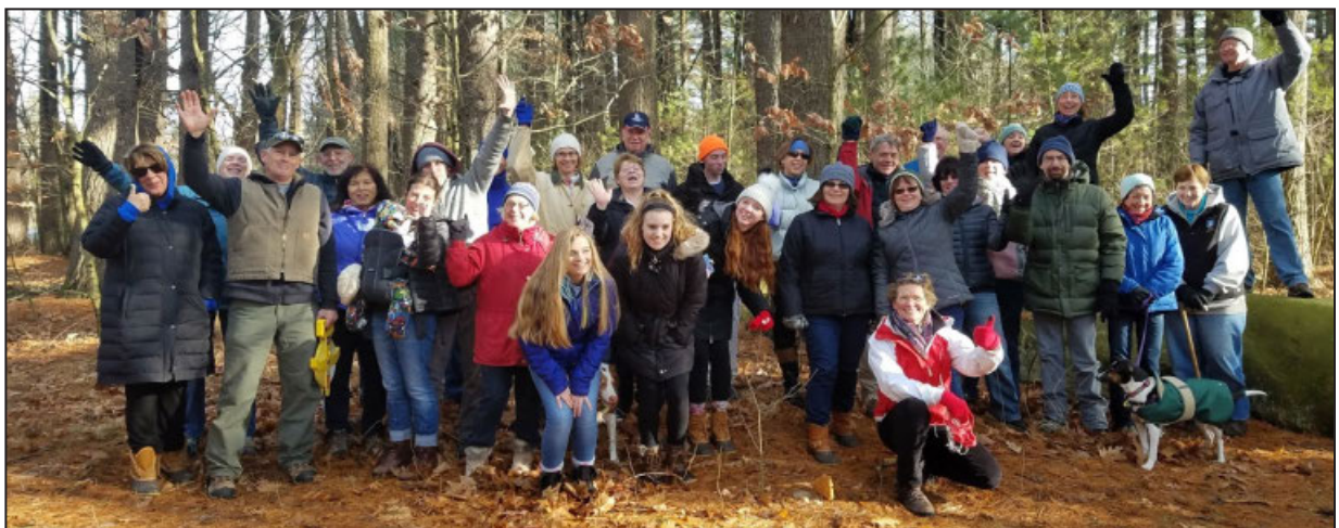
Stow Town Forest – Annual New Year's Day Hike 2018

Stow lies in one of the most populated regions in the country, yet despite increasing development pressures, has managed to maintain a small town flavor lost in most surrounding communities along the Route 495 corridor. The protection of Stow Town Forest by determined residents in the 1960s, and preservation of additional lands over the past 50 years, has played a major role in making the town what it is today. The Conservation Commission is grateful to those who preceded us, who had the foresight and determination to set aside this important land from development, to sustain our natural resources and the quality of life and health of our community. We look forward to what Stow can achieve in the next 50 years.