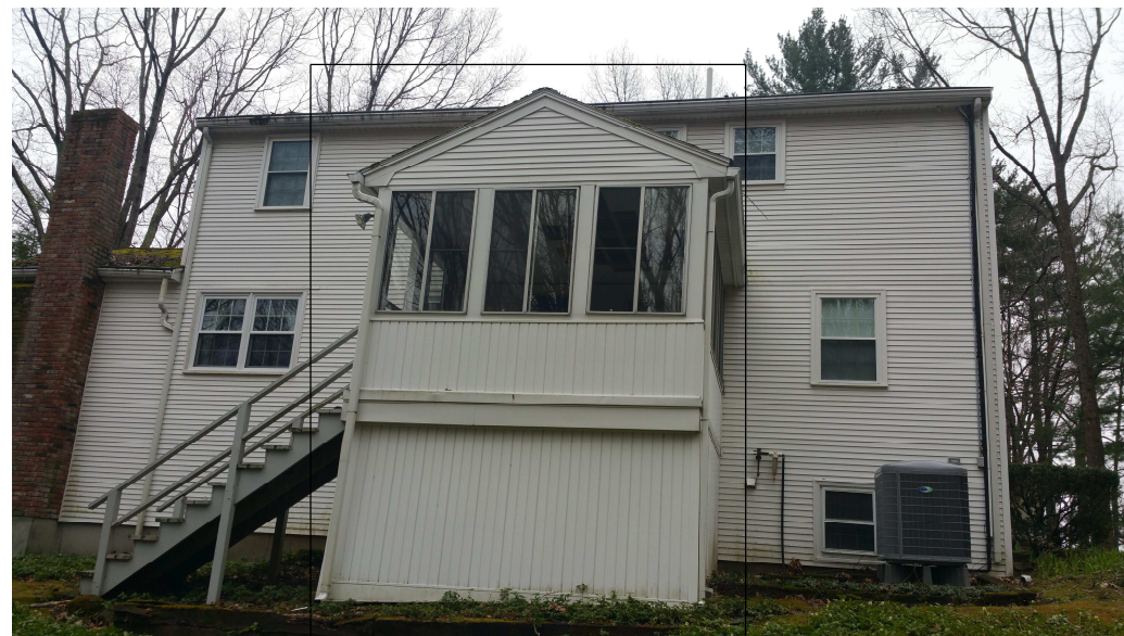
AREA OF ADDITION