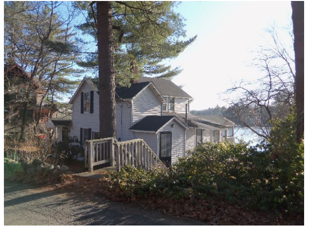
( http://images.vgsi.com/photos/StowMAPotos/\PICTURE\00085701.JPG )