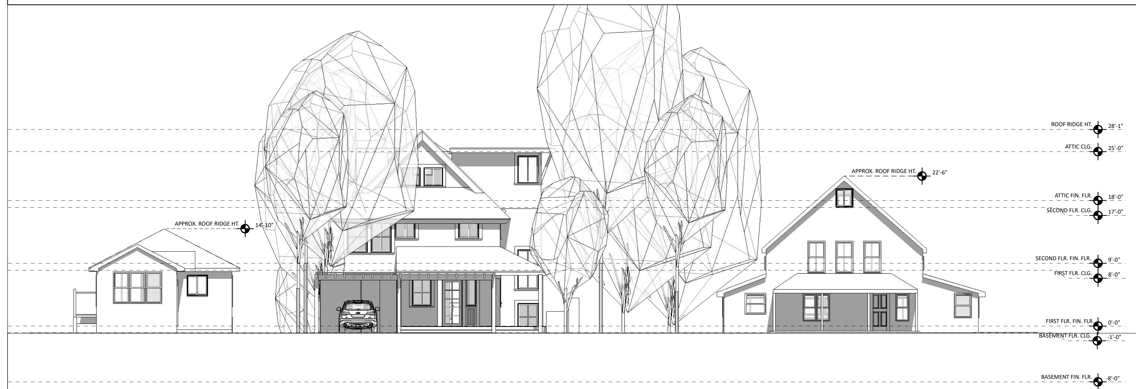
1 W - ELEVATION FROM STREET SCALE: 1/8" = 1' - 0"