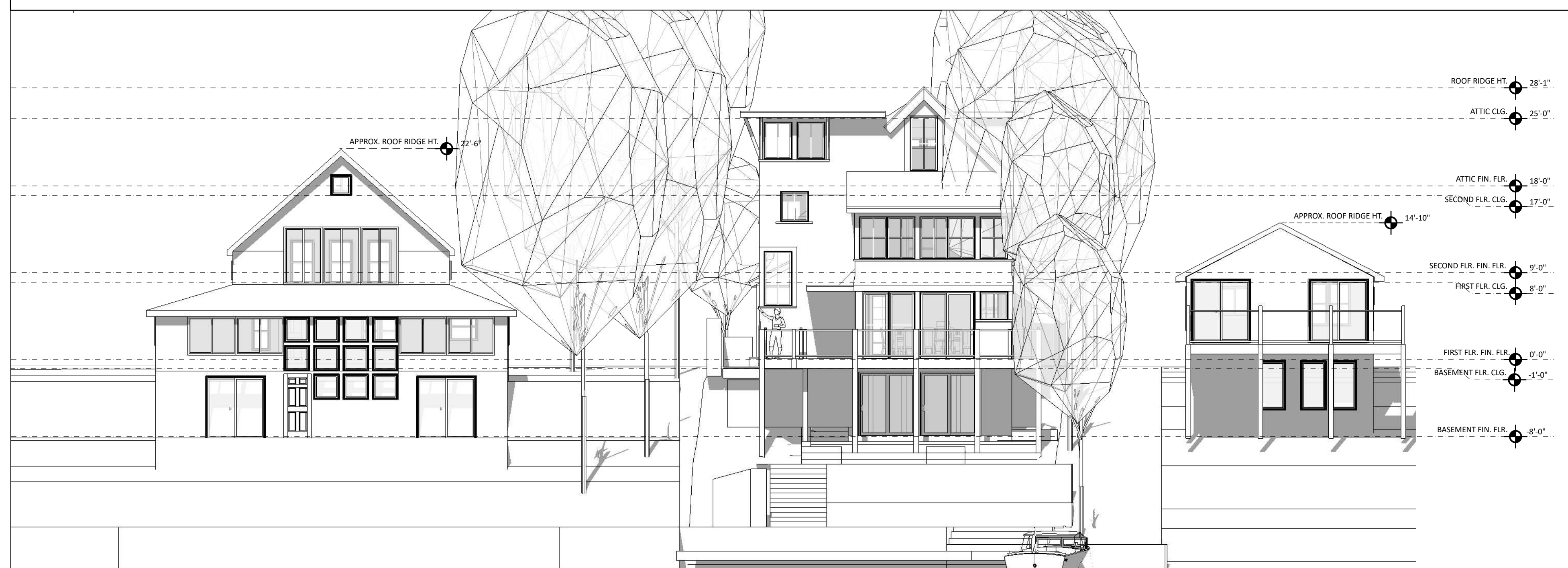
1 E - ELEVATION FROM LAKE SCALE: 1/8" = 1' - 0"