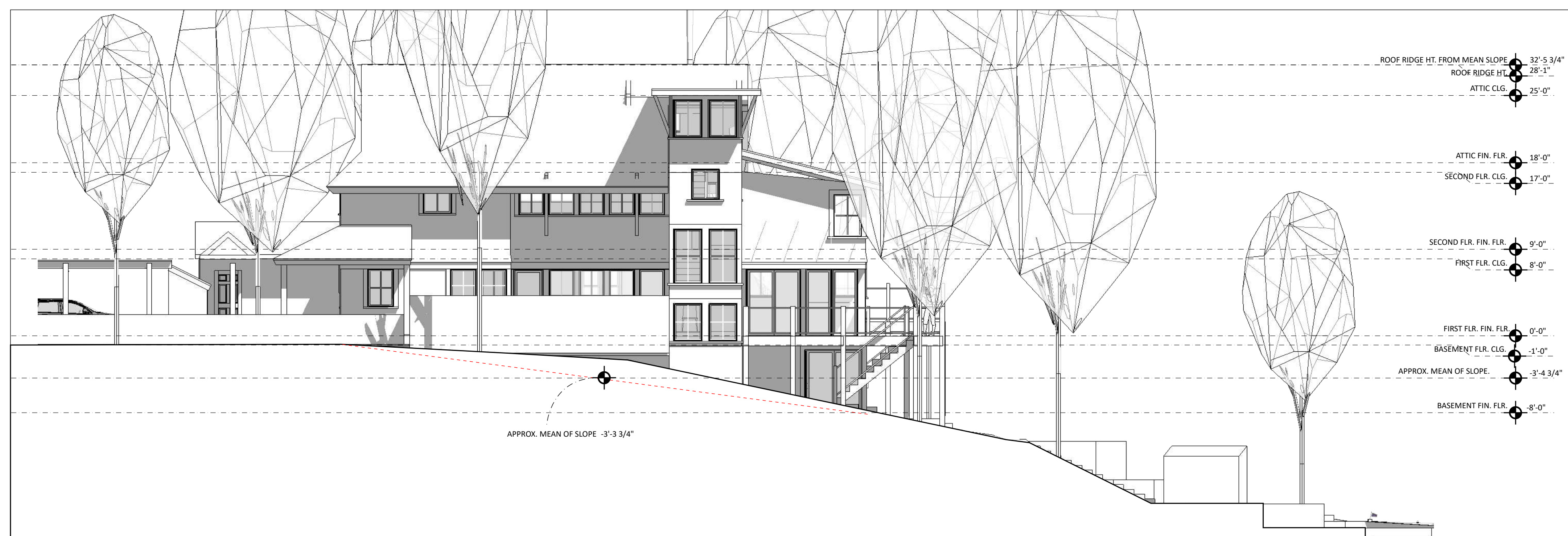
1 S - ELEVATION SCALE: 1/8" = 1' - 0"