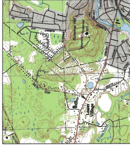
LOCUS MAP SCALE: 1"=200'

ENGINEER/SURVEYOR STANSKI AND MCNARY, INC. 1000 MAIN STREET ACTON, MA 01720 ZONING DISTRICT BUSINESS RESIDENTIAL