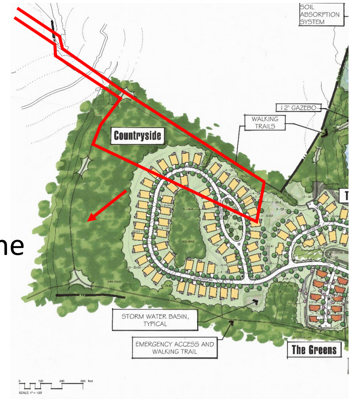
Cottages at Wandering Pond