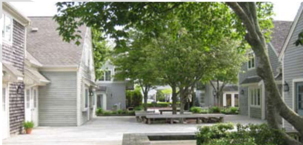
Example of courtyard space in Falmouth, MA.