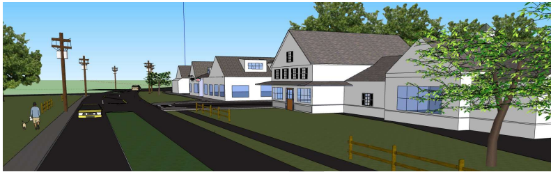
Example of potential building articulation and roofline repetition along Route 117.