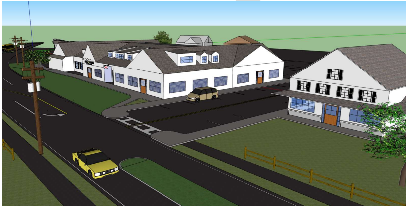
Example of Internal Access Drive positioned for streetscape parking off Route 117.