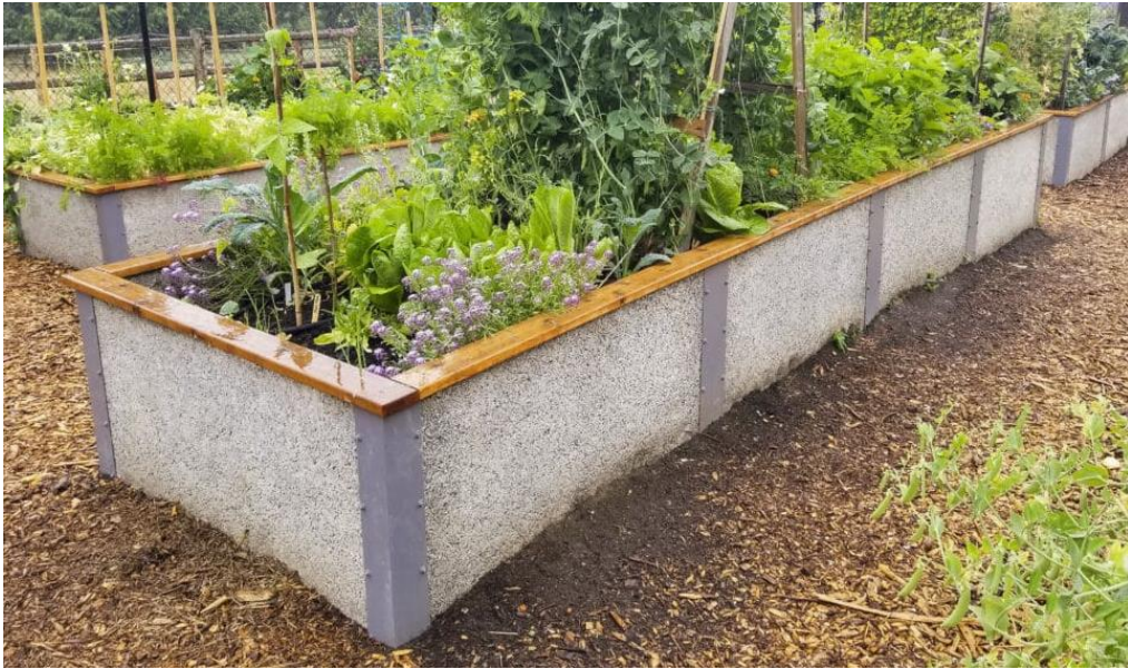
Example Raised Bed