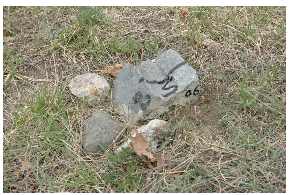
Bound HS#1 4/22/60