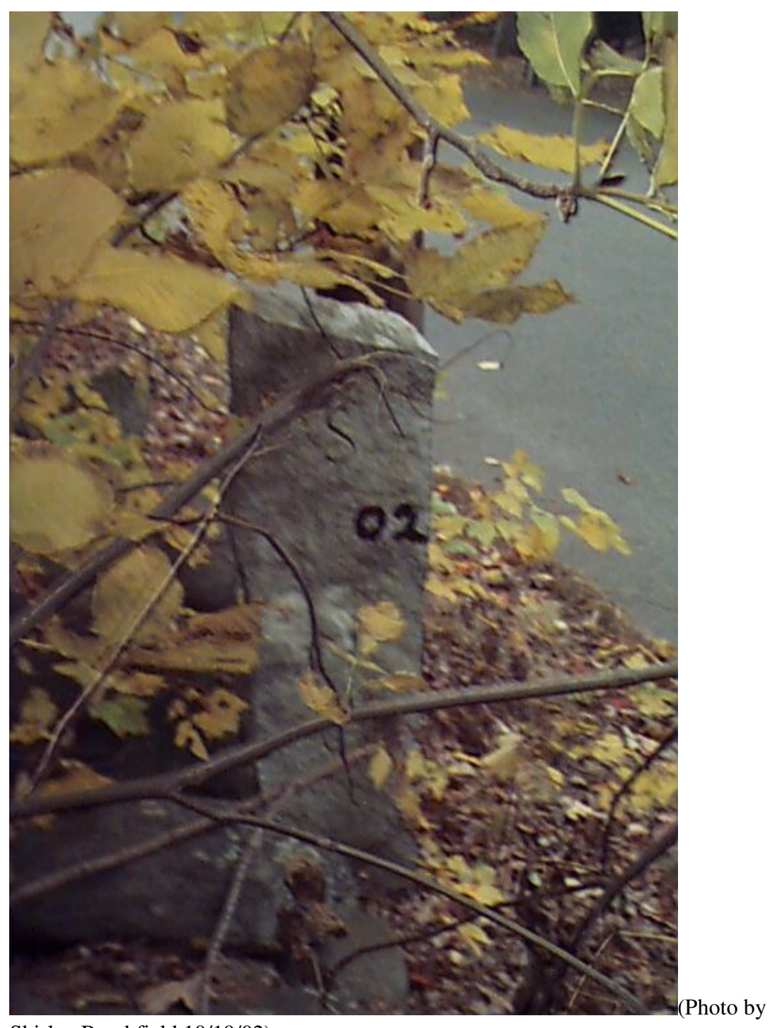
Shirley Burchfield 10/19/02)